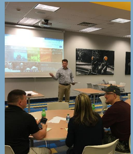
Preparing educators for a day of workshops in Beckley for the Teacher Institute.